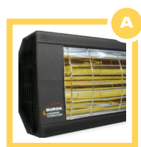
Spot or space heating for indoor applications