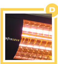
Polished aluminum reflector & quartz lamps