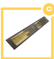
Power range from 1.5 to 6 kW